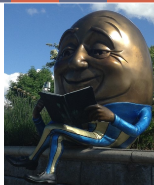
Egg Head generously donated by Grant Thornton