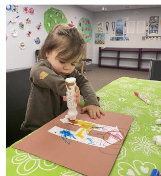
Above & Right: Crafting fun at A to Z Toddler Time.